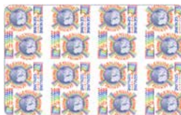
Evolis Genuine Globes Design