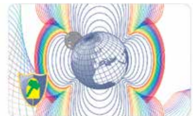
Evolis Generic Globe Design

A registered image can be described as a discreet (separate) picture and is applied in exactly the same position on each card. A continuous image is a wallpaper pattern.