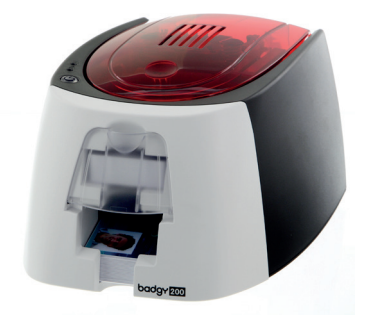
Badgy200 card printer