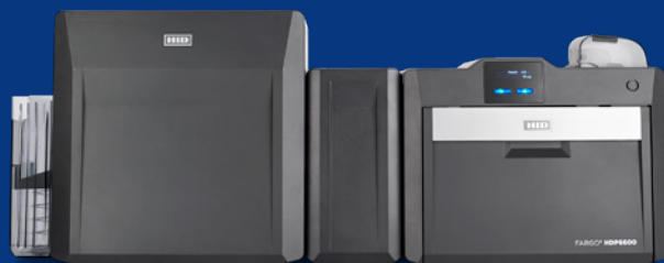
Dual-sided printer/encoder with optional lamination