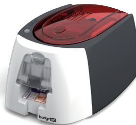
Badgy card printer