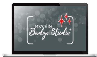
Evolis Badge Studio® card designer software