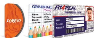
Online card template library