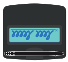
"How Can I Tell if it's Working?"